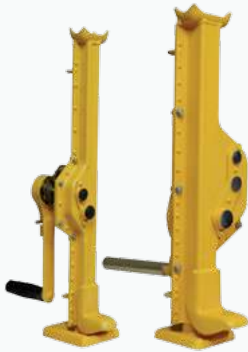
CJ15 & CJ100 Shown