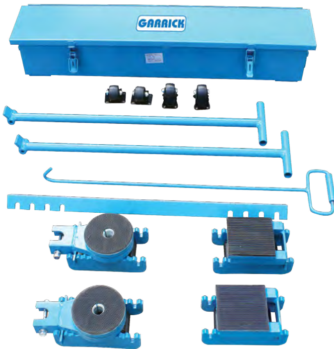
Load Skate Kit

The individual Skates are rated at 10T each, but used as a kit of 4 pieces, the total capacity is rated at 20T in the event that 2 Skates are carrying the whole load on uneven surfaces, plus the use of turntables, packing plates & bars also reduces possible effective capacity