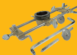
96.TJ1202H Plasma Cutting Circle Guide - PT-60