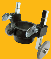
TJ1536 Plasma Roller Guide - PT40/PT60