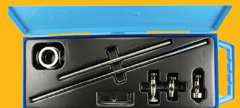
96.51866 Circle Cutting Attachment Tecmo PT25/PT40/PT60 Trafimet S45