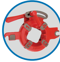
Manual Die Head for Pipe Machines