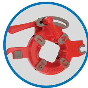
Manual Die Head for Pipe Machines