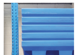
Nestable for transport