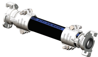
2" (DN50) Black Minsup assembly with Boss™ clamps