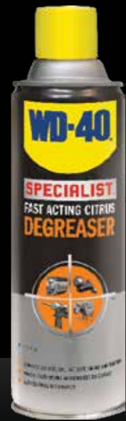
FAST ACTING CITRUS DEGREASER