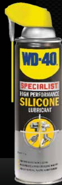
HIGH PERFORMANCE SILICONE LUBRICANT