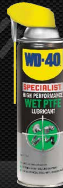
HIGH PERFORMANCE WET PTFE LUBRICANT