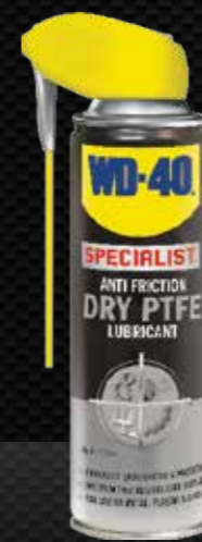
ANTI FRICTION DRY PTFE LUBRICANT