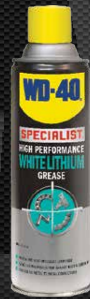
HIGH PERFORMANCE WHITE LITHIUM GREASE