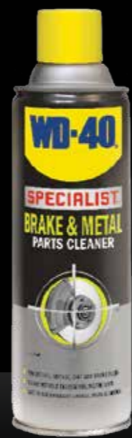
BRAKE & METAL PARTS CLEANER