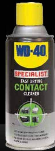
FAST DRYING CONTACT CLEANER