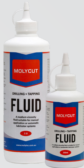
FLUID 250ml Bottle - M410 1L bottle - M412