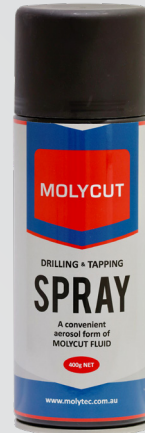
SPRAY 400g Aerosol - M420

MOLYCUT is a range of high-performance lubricants designed for severe metal working operations such as drilling, reaming and tapping. They are highly concentrated mixtures of lubricity and reactive extreme-pressure and anti-wear additives. All of the products in the range provide excellent surface finish to components and protect tooling from wear and damage.