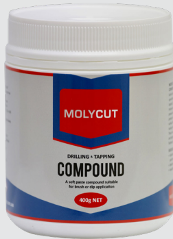
COMPOUND 400g Tub - M400 2kg - M401 & 65g Tube - M402