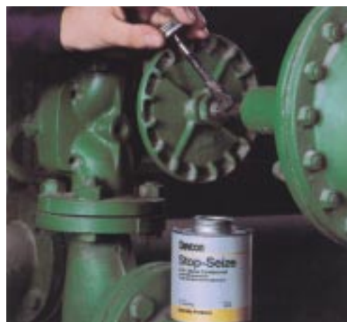
Threaded fittings are protected against sealing and locking with Stop Seize high temperature lubricant.