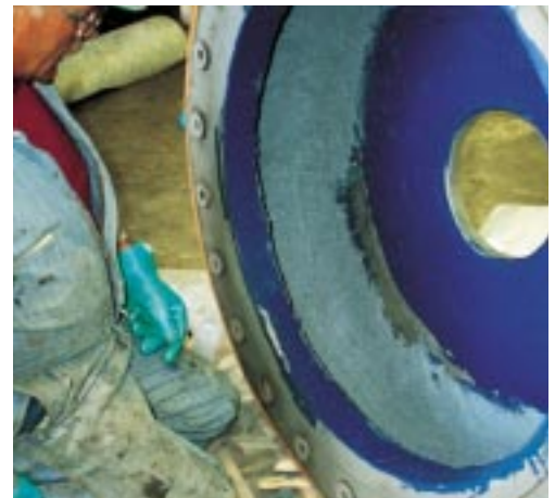
Wear Guard High Load offers an economical way to protect equipment surfaces from abrasion damage caused by particulate greater than 3mm.