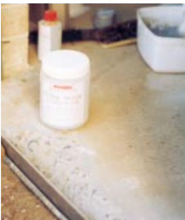
Remove all loose material and provide shoring to shape the repair by Floor Patch

This extremely versatile and high performance product has approximately three times the compression strength of concrete. It can be used to resurface old or new concrete, sealing masonry walls, excellent for filling old anchor bolt holes or anchoring machinery in concrete or masonry as it is non shrinking and non sagging. Floor Patch has good impact strength and resistance to oils, petrol, water, alkalis and acids. Sets quickly and cures overnight.