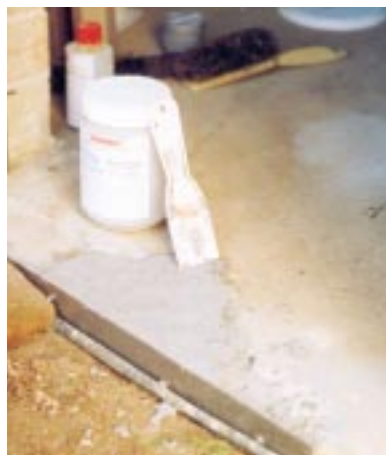
Floor Patch is easily applied and can be coloured to match the surrounding surface.