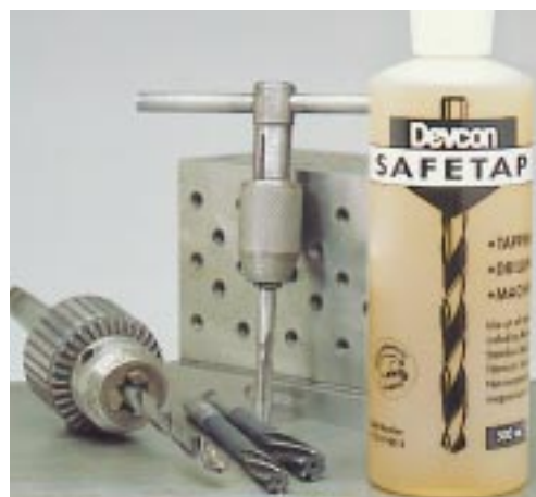
Safetap liquid - helping you work with metals and plastics safely.