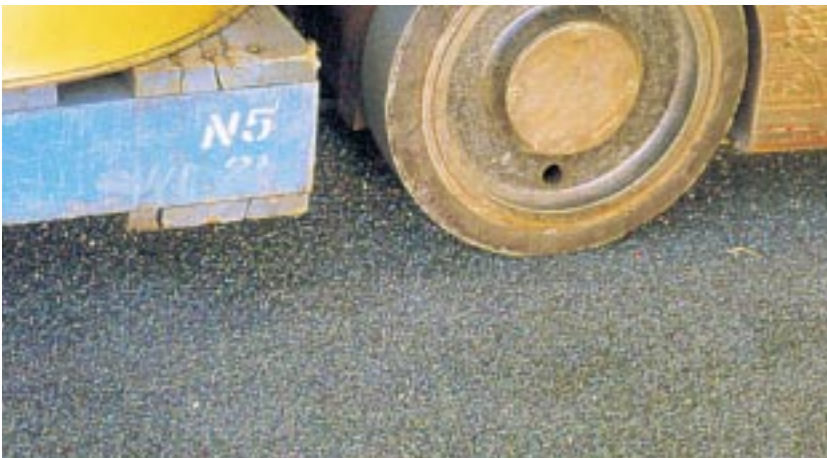
Devcon's Floor Grip Anti Skid provides a durable, non-slip surface on steel, wood or concrete, and is impervious to most liquid spills.

This durable epoxy can be used on steel, wood or concrete and produces a long lasting anti-skid surface for floors, ramps, stairs, catwalks, loading docks or anywhere a safety hazard exists. Floor Grip is easily applied by brush or roller and carbide granules are sprinkled over to provide a superb non slip finish. It is impervious to water, weather, oils, petrol and most chemicals and cures as low as 4°C.