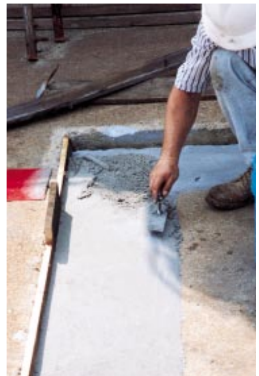
Floor Patch is also ideal for doing larger repairs.