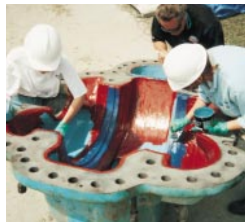
Brushable Ceramic provides pumps and other equipment with a smooth protective barrier against wear, abrasion, corrosion, erosion and chemical, attack, and it fills holes and voids in castings.