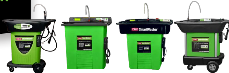
SW-23 Mobile Parts/Brake Washer