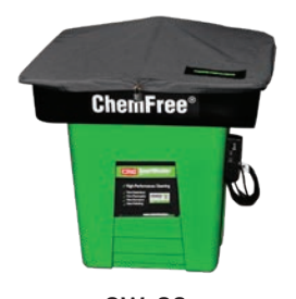
SW-28 SuperSink Parts Washer Cover