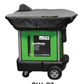
Mobile Heavyweight Parts Washer Cover