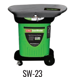
Mobile Parts/Brake Washer Cover